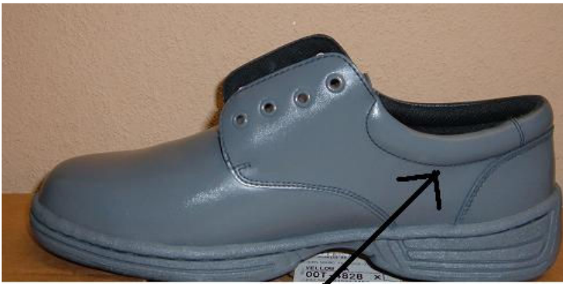
Bottom of pant leg should reach lowest point of this threaded seam