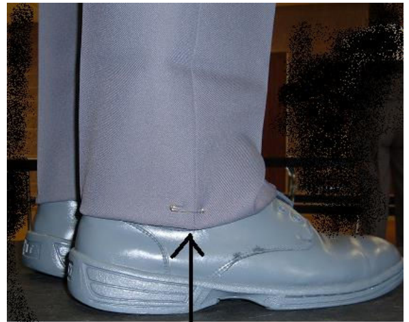
Correct pant length falls to lowest point of stitched seam